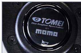
Silver color logo design

The collaboration steering wheel based on the MOD.08 330mm. Center mark with a chic gray, with the TOMEI logo embroidered on the spokes and the mark embroidered on the bottom of the grip. The included horn button also has a design unique to this collaboration.