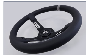
Deep cone type