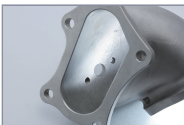
Wide mouth design

Reduced restriction and smooth merging at the by-pass port together improve the total flow and lead it straight to the front pipe.