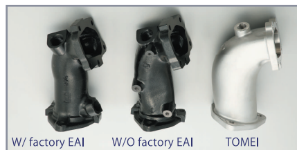
W/ factory EAI W/O factory EAI TOMEI

Wide mouth design dumps the exhaust gas from the turbo straight to the front pipe without reducing the flow speed.