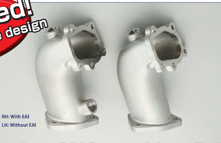
RH: With EAI LH: Without EAI