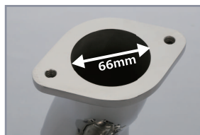
Step-less connection with a 70mm front pipe.