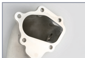
Wide mouth design

*Numbers may slightly differ due to manual measurement.