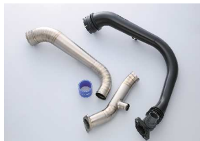
Smooth structure and optimized piping layout allows more air to get into the engine.