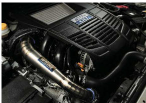
Beautiful look of the titanium.

Titanium Intake Pipe is lighter and stronger comparing to the stock plastic pipe. Optimizes the air flow all the way from the turbo by eliminating those unnecessary steps and dents seen on the stock pipe. Titanium pipe also improves the appearance of the engine compartment.