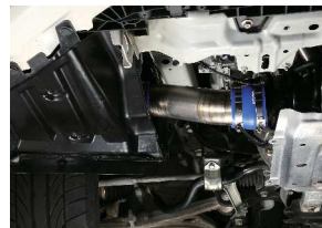
Ref: Installed image

Increases the performance by eliminating the intake air resistance of the stock bellow hose.