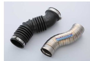
Smooth structure without the bellows.